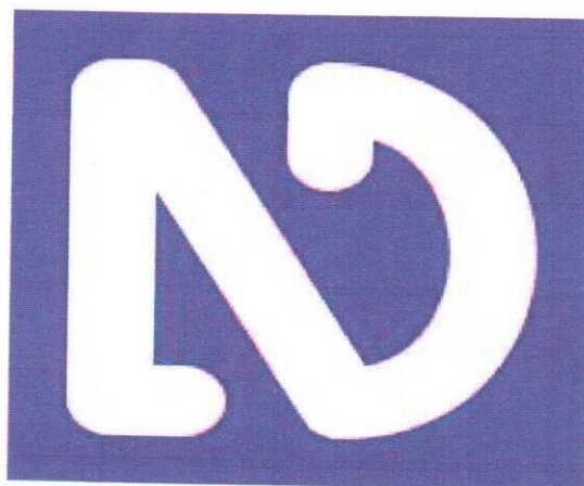
Usage of NDVA software for disabled person

Approved by AICTE & PCI, New Delhi - Affiliated to JNTUA, Anantapur NH - 18, Nandyal, Kurnool District, Andhra Pradesh - 518501.